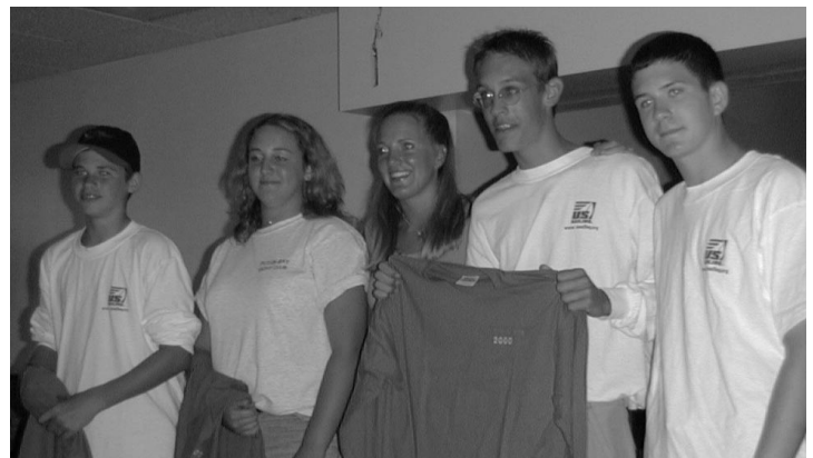
Our Jr. Bay Week Sailing Teams and Instructor

Bring "swim deck nibble". Bathing suit is necessary as eating is done in the water!